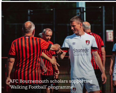
AFC Bournemouth scholars supporting 'Walking Football' programme