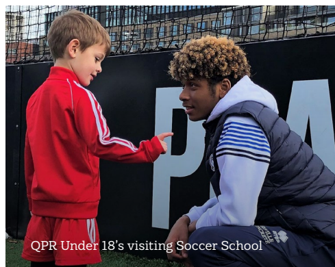
QPR Under 18's visiting Soccer School