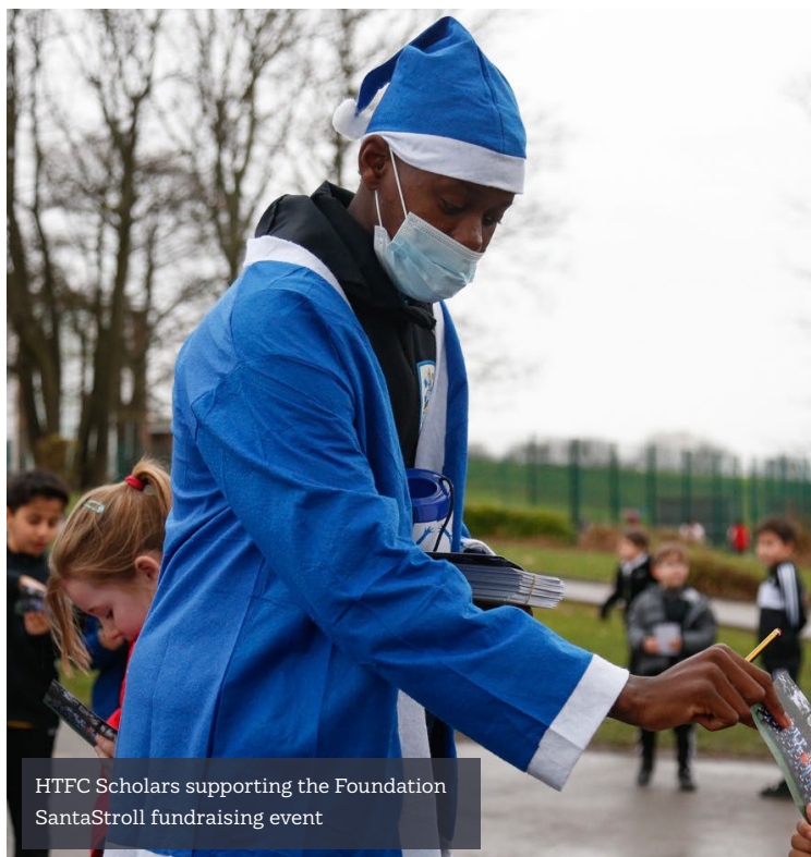
HTFC Scholars supporting the Foundation SantaStroll fundraising event